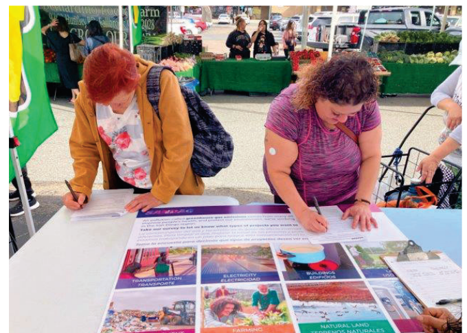
Community members complete the survey at a CBO event