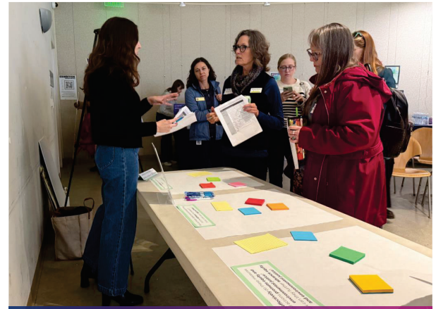
Breakout session at the February 2025 Regional Workshop