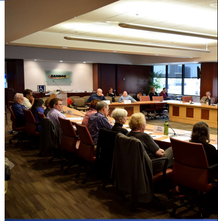
Presentations and Public Hearing