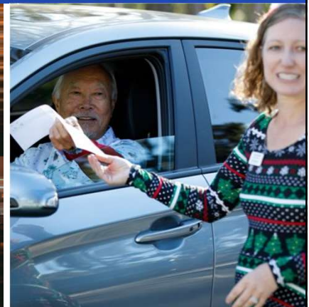
Fulfill Requirements Ensure Access to Funding