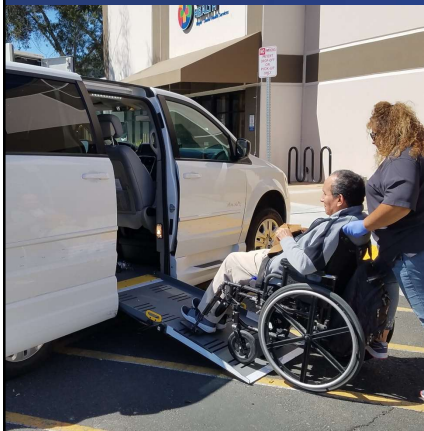
Transit and Specialized Transportation