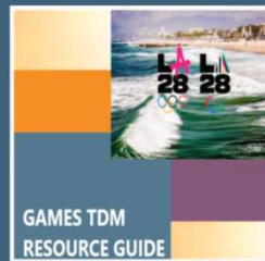
Games TDM Resource Guide