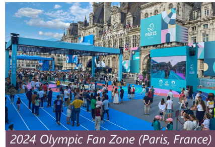
2024 Olympic Fan Zone (Paris, France)

SOUTHERN CALIFORNIA ASSOCIATION OF GOVERNMENTS