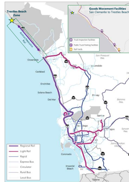
Source: 2025 Regional Transportation Network Map; Freight Portal Map, SANDAG