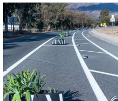
Protected Bike Lane