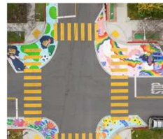
Artistic Curb Extensions