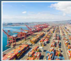
Synchronization with Ports