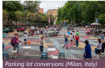
Parking lot conversions (Milan, Italy)