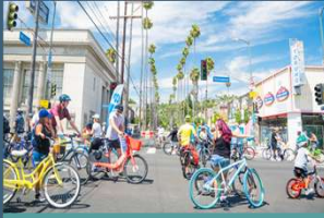
Open Streets Events