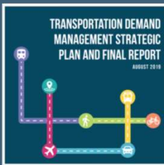
Updated TDM Toolbox