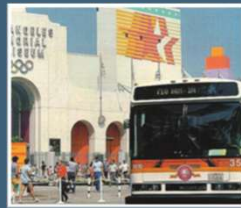
Last Mile Connections