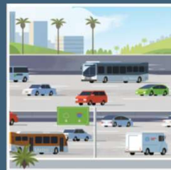
Outreach to Businesses/Employers